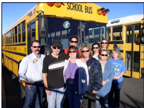
Pictured are nine of the eleven bus drivers ready to transport students home from Pinon Mesa Middle School.

The Transportation Department has a total of 44 staff members.