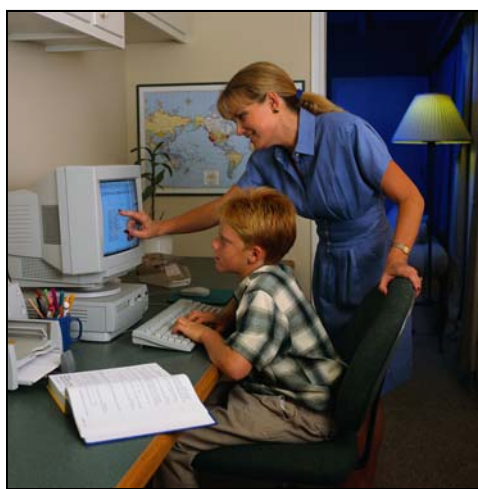
Parent involvement doesn't always mean that parents have to come to the school site. It can also mean helping with homework, reading with your child, or learning something new together.