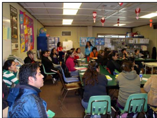
Events are held to encourage parent participation at all levels so parents can be involved in their child's education.

"Beginning April 2 nd through April 16 th , and all the way through state testing, Pinon Mesa Middle School will be implementing a "Take the Challenge—NO T.V./Video Games" campaign across our campus. These designated days represent the 10 days prior to state testing. Research has shown that children's brains take around 48 hours to detoxify from the effects of T.V. and video games. Our strategy is to have student brains fully alert and detoxified for state testing. For more information please see our website and review the PowerPoint presentation that is available."