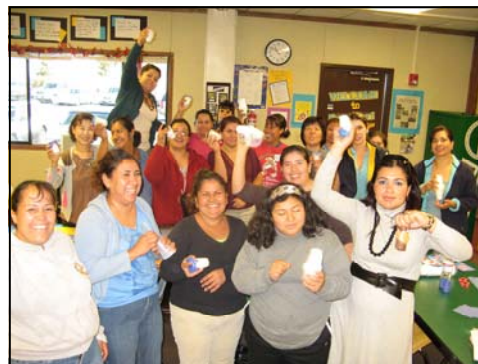
Snowline Joint Unified School District offers English as a Second Language classes to those families participating in the Even Start Family Literacy Program which serves parents and children ages 0-7.