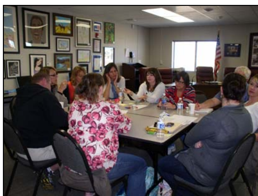
Pictured above are Middle School TLLs reflecting on their work and discussing next steps.