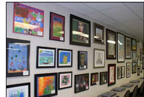
2010 Young Artist gallery in the Snowline School Board of Education Room in the Curriculum & Educational Services building.