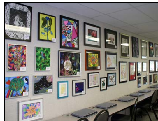
2011 Young Artist gallery in the Snowline School Board of Education Room in the Curriculum & Educational Services building.