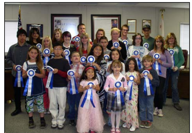
2011 Snowline Young Artists being honored at the May 10 Board Meeting.